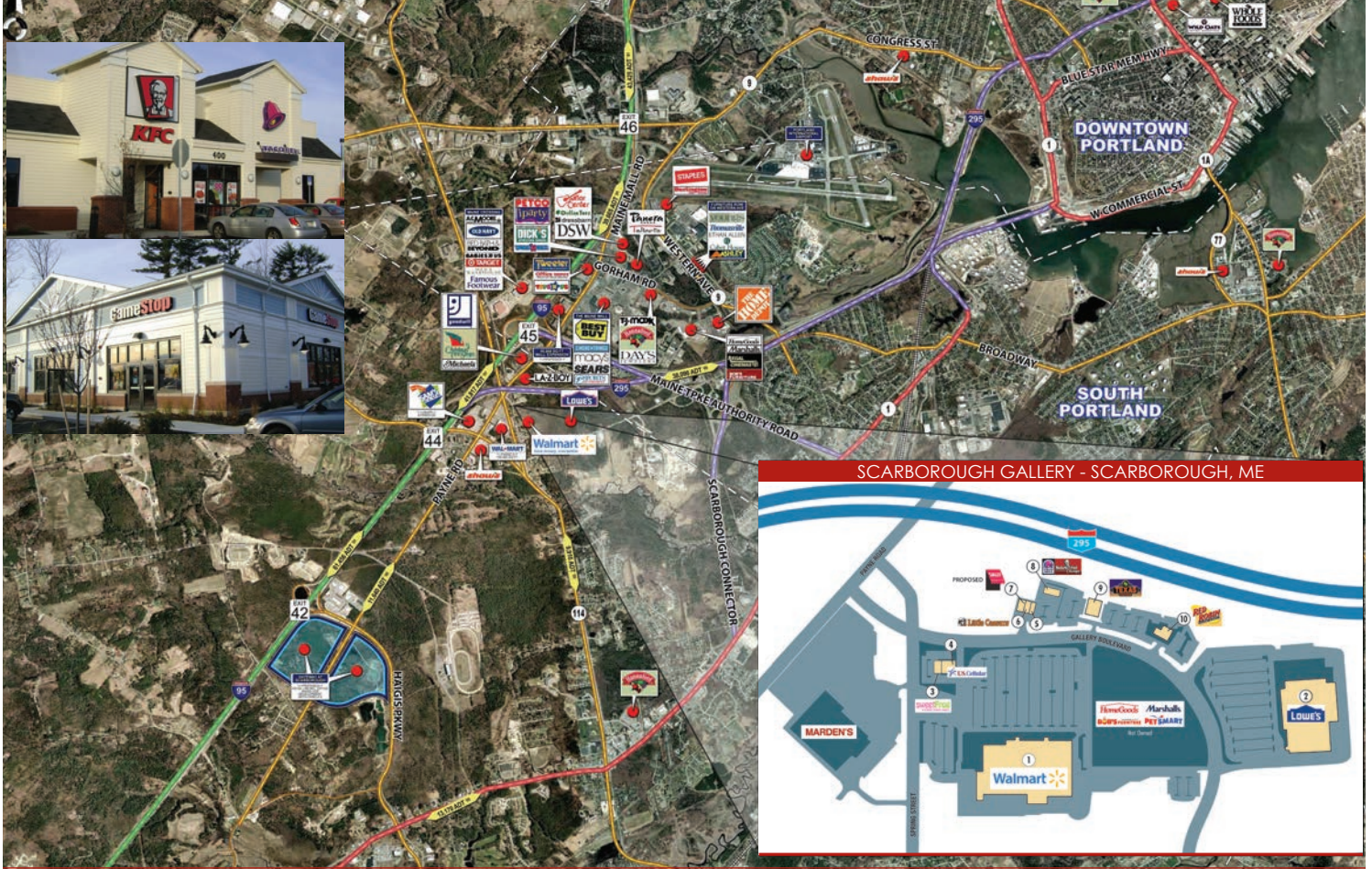
SCARBOROUGH GALLERY - SCARBOROUGH, ME